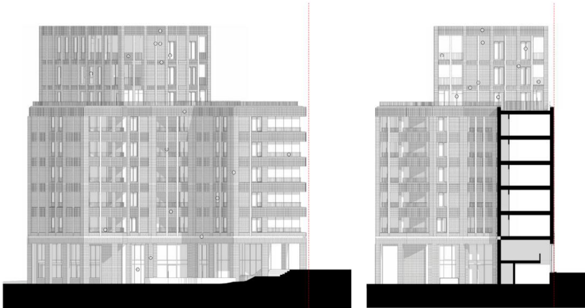
South elevation and section